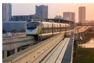
Figure 1: STEC's projects in the pipeline under concession